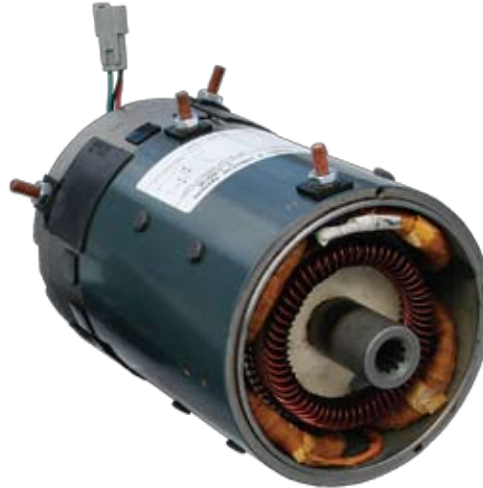
D388 - IQ Torque Motor, 10 spline 48 V 5HP @ 2740 RPM

Application: Torque\Lifted Cars 4-pass kit or utility box