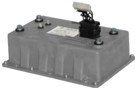
608 500 amp GE Controller, 5K-0

Up to 22 mph with 608 GE controller using stock gears & 22" diameter tires